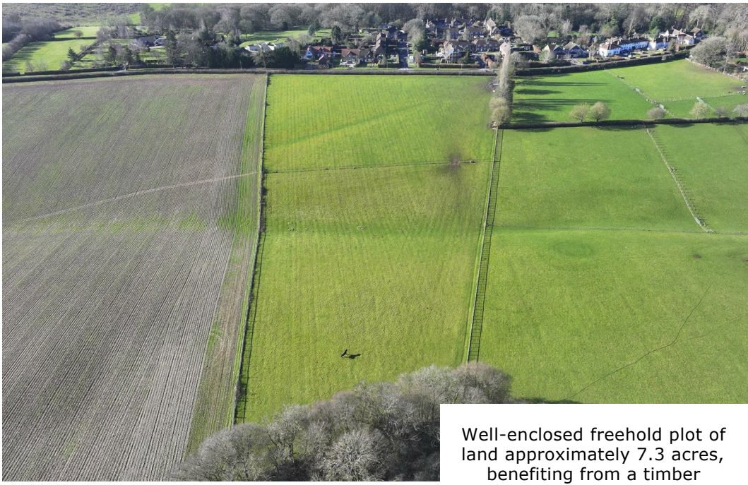
Well-enclosed freehold plot of land approximately 7.3 acres, benefiting from a timber stable block and mains water, making them ideal for private equestrian or hobby farming use.